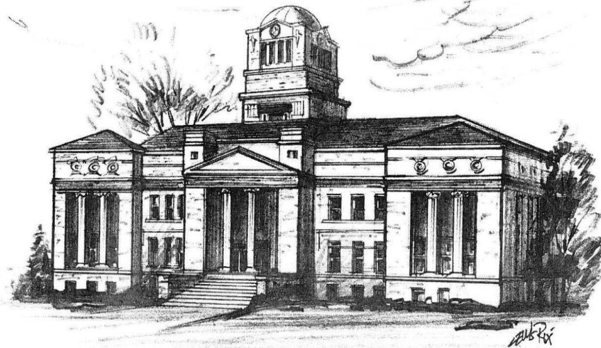
Navarro County Courthouse

NAVARRO COUNTY COURTHOUSE CORSICANA, TEXAS 75110